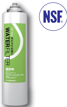
UF-592 Block Activated Carbon Filter

ACUO's P.P. Filters are manufactured with absolute 5 and 1 micron filter pores, ensures 99% block out rate!