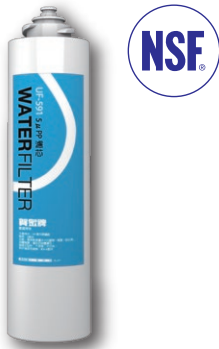
UF-591 5 Micron P.P. Filter