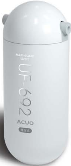
Φ101 x H270 (mm)